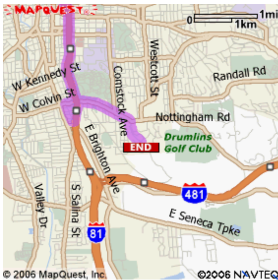
From the NORTH, SOUTH, or WEST